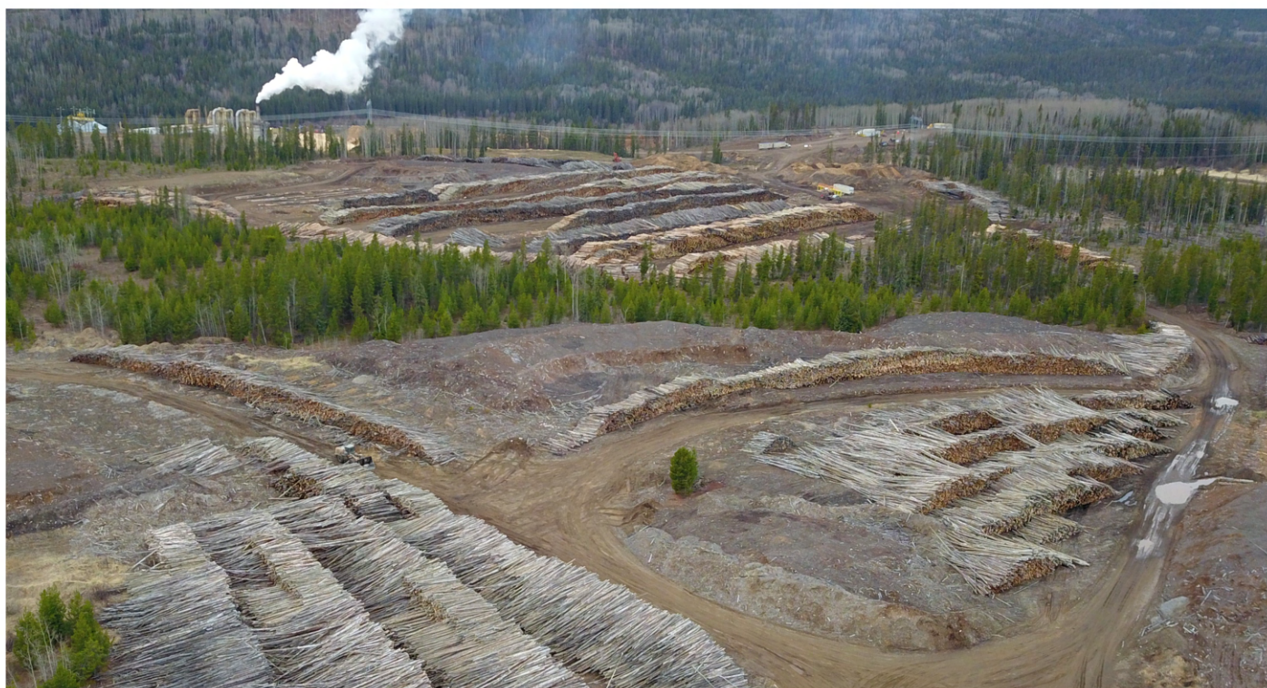
Logs piled outside of Drax pellet plant near Burns Lake, B.C. Photo taken May, 2022.